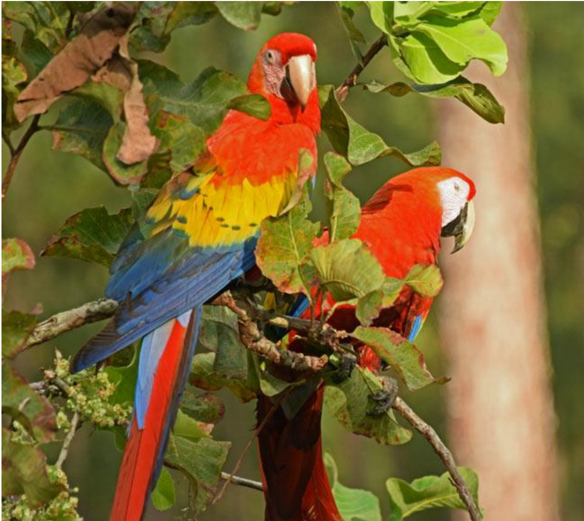
Location: Mabita, la Moskitia, Gracias Dios, Honduras.